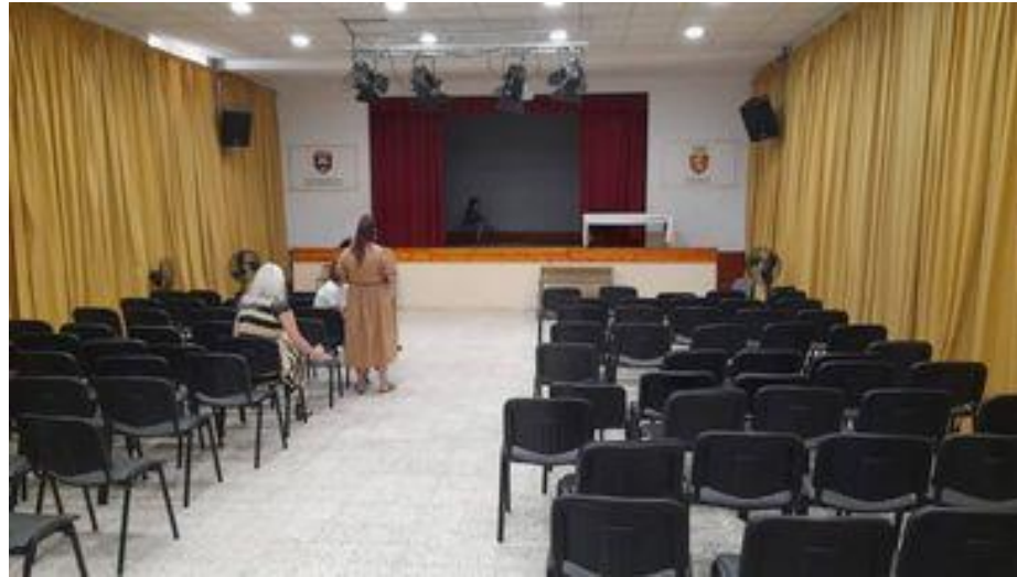
This is the theatre area.